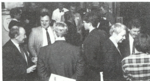
Business After Business – July 1992